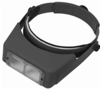
(U.S.A.) Optical glass magnifier.

DNG001 Optivisor This essential binocular tool brings your painting and hobby work into extreme closeup. No more squinting to see whether those eyeballs or buttons are in alignment! I'm still using the one I bought 20 years ago to paint soldiers and assemble models.....$ 45.95 DNG002 Optivisor Magnifier Here's an add-on which doubles the magnification of the Optivisor. Simply screw it into the front of the Optivisor (it works on either right or left) and go to work.....$ 15.95 DNG003 Optivisor Light This battery-powered add-on gives you a 6000 candle-power xenon laserbeam high-intensity light source which is focused directly on your work. A hands-free device, it simply it clips onto the Optivisor.....$ 33.95