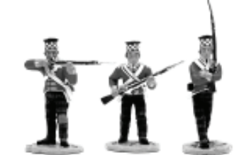
93rd Highlanders, 1812 17477 3 Sutherlands. (2003) . $ 150.00