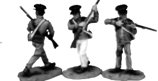
New Orleans Greys 17517 Travis's unit dressed in gray uniforms. (2003) ..... $ 150.00

See every current Britains set on our web site: www.toysoldierco.com