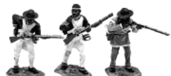
Negro Freedmen 17521 3 figures. (2004) ..... $ 150.00