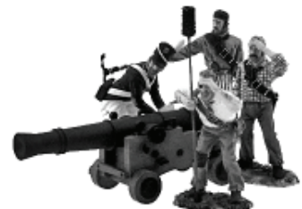
Pirates with Cannon 17519 4 crewmen, including 3 swarthy pirates and a U.S. Infantryman, with a gun mounted on a naval carriage. (2004) ..... $ 325.00