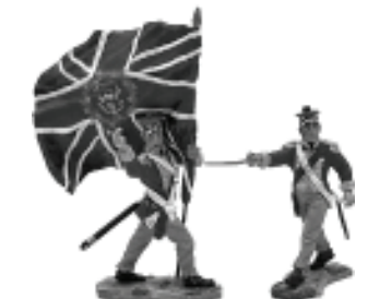
93rd Highland Command Set 17524 Officer and flag bearer. (2004) ..... $ 150.00