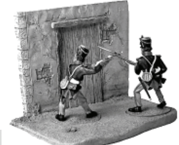
Mexicans Attack Bowie's room 17518 One soldier batters down Bowie's door while another stands by, ready to charge in. (2003) ..... $ 185.00