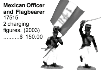
Mexican Officer and Flagbearer 17515 2 charging figures. (2003) .....$ 150.00 (shown below) Texians with Cannon and Wall 17513 2 figures wheeling the gun into position while a third loads his rifle. Highly detailed diorama piece features full-sized painted resin building corner. You can use this with the CTS Alamo. (2004). ..... $ 325.00