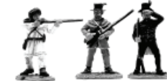
Jackson's Tennessee Volunteers 17475 3 figures on the firing line. You can also use these guys at the Alamo. (2003) ..... $ 150.00

See every current Britains set on our web site: www.toysoldierco.com