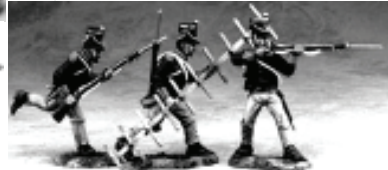
Alamo Mexican Aldama Permanente 17472 3 figures in action. (2003) ..... $ 150.00