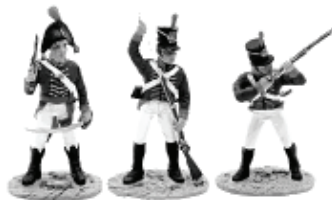
U.S. Marines 17522 3 figures. (2004) ..... $ 150.00