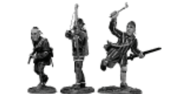
Choctaw Warriors 17520 3 figures. (2004) ..... $ 150.00