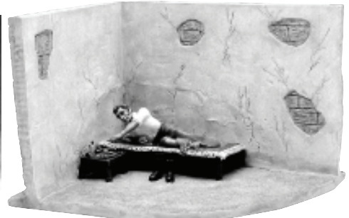
Jim Bowie in his room 17468 A brace of pistols and his knife are on a bedside table. (2003) . $ 145.00